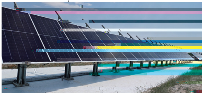
Figure 1: Project Picture

To conduct an in-depth study on the real performance of modules under low-light conditions, JinkoSolar commissioned the National Photovoltaic Quality Inspection Center (CPVT) to carry out an outdoor empirical study in Yinchuan, Ningxia, northwest China, in June 2025. The study compared the power generation performance of JinkoSolar's TOPCon modules and N-type BC modules under low irradiance. The purpose of this test study is to go deep into the contributors of yield gain in low-light conditions, including early morning, late afternoon, cloudy or foggy or rainy days. During these times, all research solar modules can't work as well as in strong sunlight, but which are impacted less and can keep making good power.